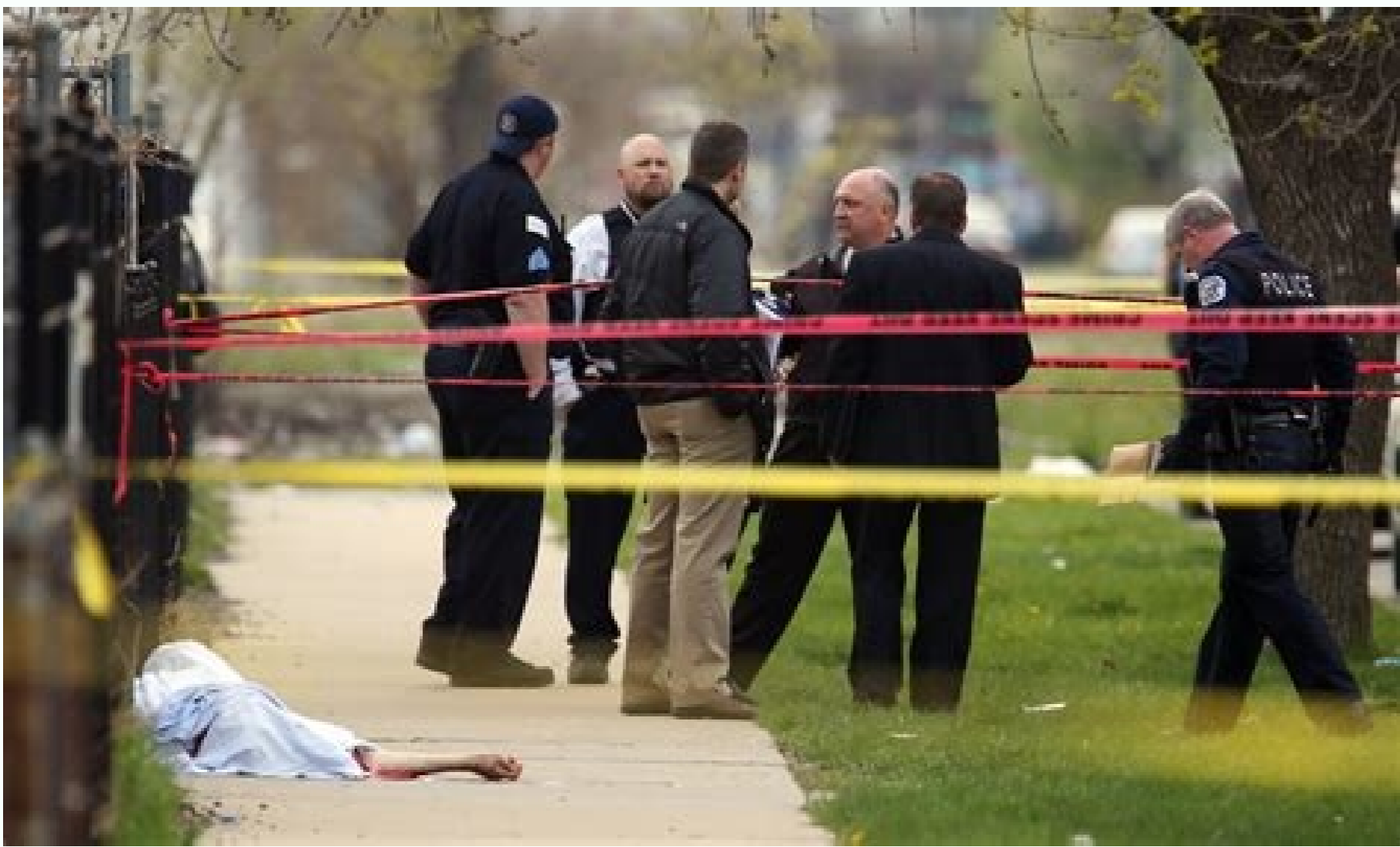
Fbi uniform crime report january-june 2019.